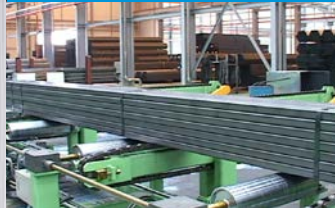
WEIGHING & BUFFER STOCK