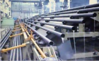
CAPTURING & COUNTING